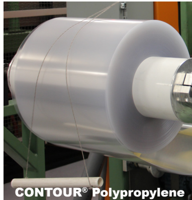
CONTOUR® Polypropylene High in moisture barrier and heat deflection properties