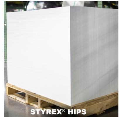
STYREX® HIPS Provides reliable performance plus yield advantage

Each show we exhibit at is an opportunity for us to also strengthen our relationships with both prospective and existing customers. We always look forward to interacting with an audience that is genuinely interested in the quality products we offer. These shows allow us to establish our brand as a true industry leader and garner feedback that can help our company improve.